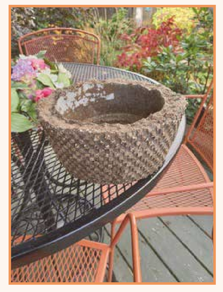
A rustic container fresh from the mold.