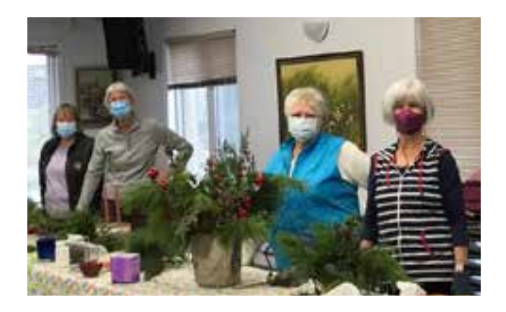
Bedford Horticultural Society members are shown at their recent workshop. Below, some of their creations decorate the tables for Christmas dinner. All Covid guidelines were followed and it turned out to be a very enjoyable event.