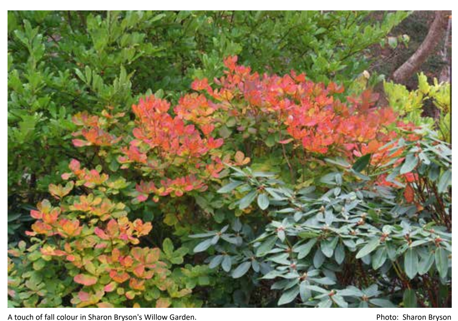
A touch of fall colour in Sharon Bryson's Willow Garden.