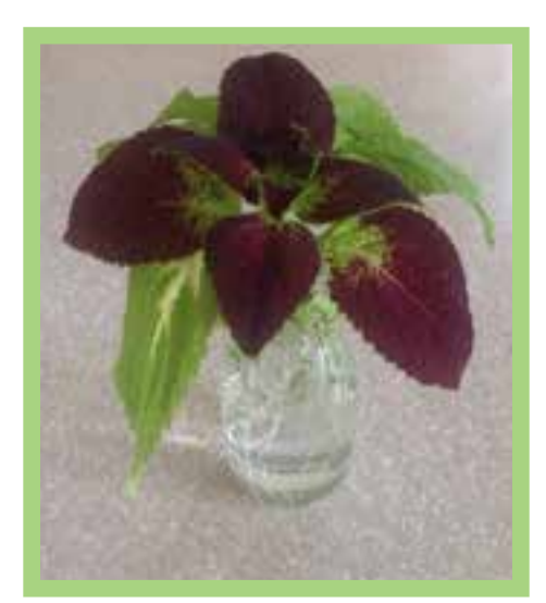
Editor's Note: The common Coleus is also known as the painted nettle. It is clear to see why. It is so easy and so much fun to root coleus on your window sill. The ones rooting in the photo here are ready to be planted.

From Emily Walker: This cobweb adorned corn stalk arrangement was part of a friend's Halloween decorations. It was unexpected to find this display in the living room but it was pretty effective: unique, spooky and a great conversation piece!