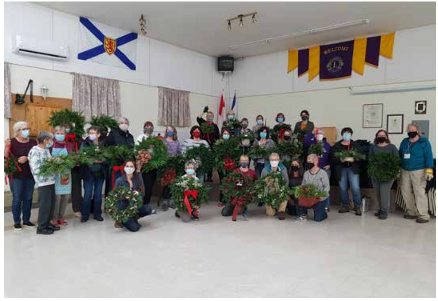
The Eastern Shore Garden Club enjoyed an excellent turnout for their Christmas decorations workshop. In this photo, members are showing off their creations.

by Linda Disbrowe, Eastern Shore Garden Club