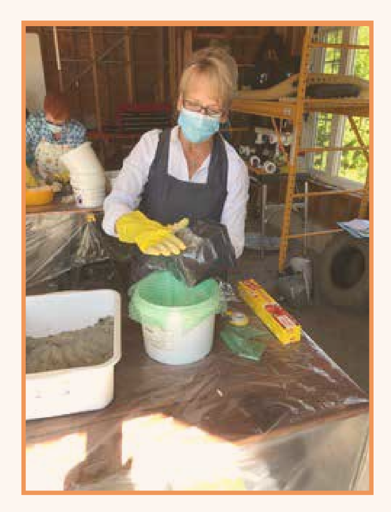
Patting the mixture into the mold.