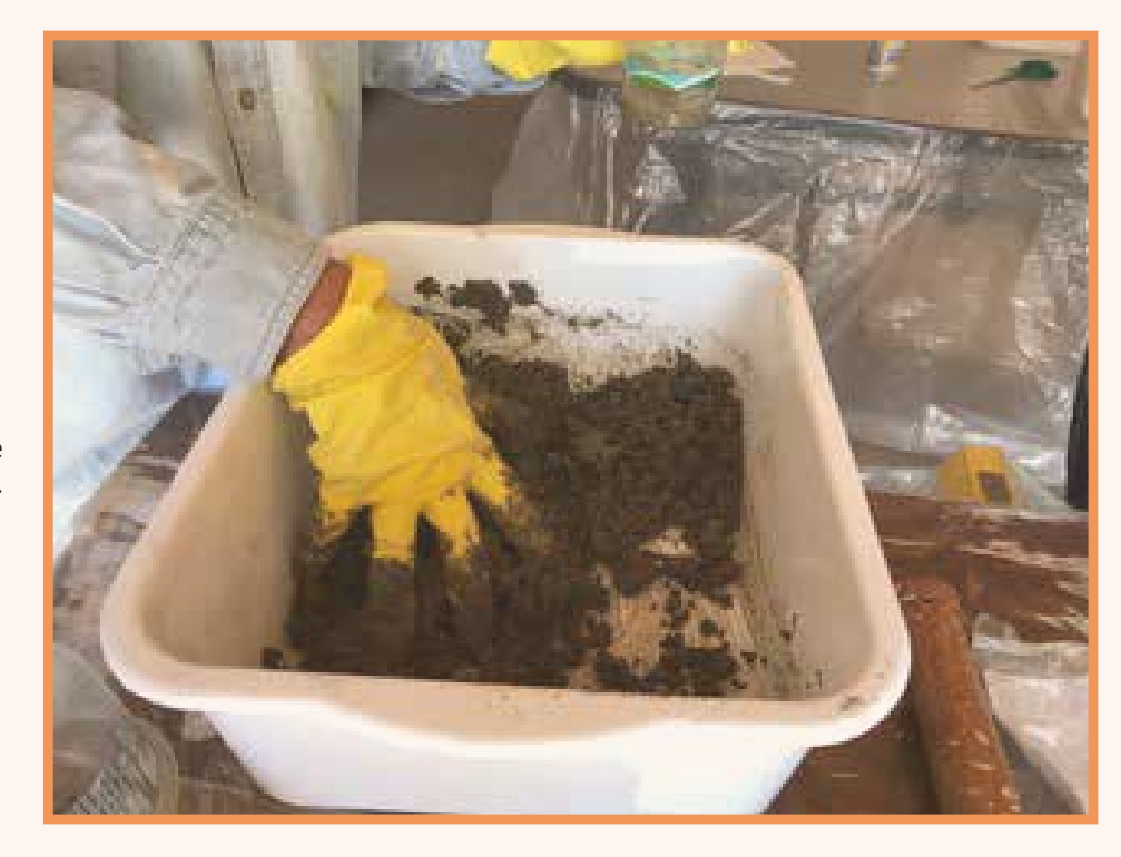
Mixing the ingredients.